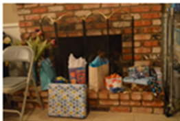
Desirable Gifts for Stealing!